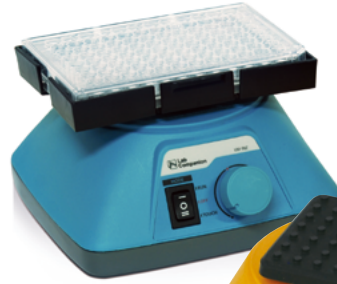
VM-96T (Persian Blue)